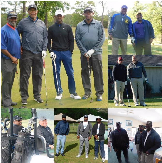
Various golfers and staff at the tournament.